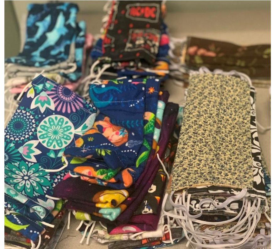
Benzie Bus, Beulah, MI