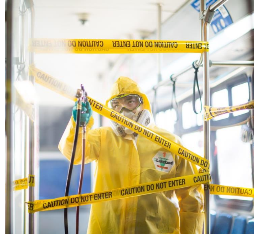
Via Mobility Services, Boulder, CO