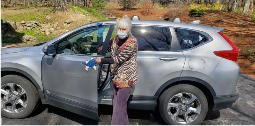
Community Volunteer Transportation Company, Peterborough, NH